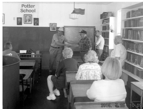
About 20 Younkings attended the morning program.