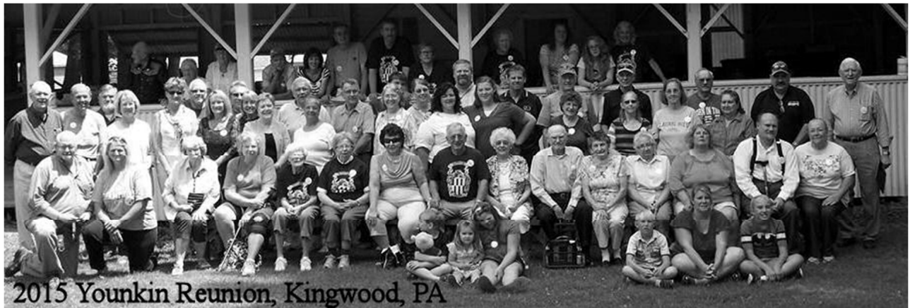
2015 Younkin Reunion, Kingwood, PA